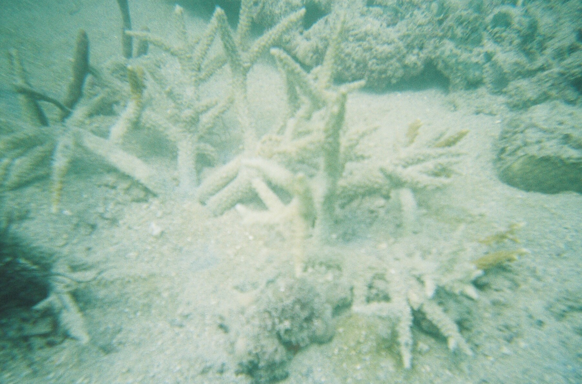
Corals Buried and Smothered by Beach Dredge Fill Hollywood Florida Aug 2005